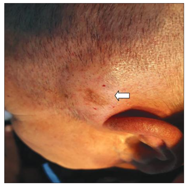
Fig. 3. Seborrheic Keratosis