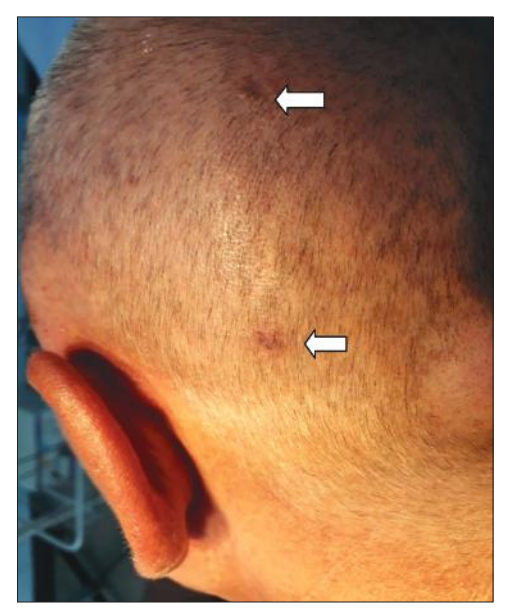
Fig. 1. BCC, superficial form