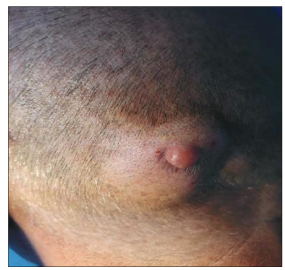
Fig. 2. Neurofibroma

Family history : unknown-the patient is not familiar with the biological family.