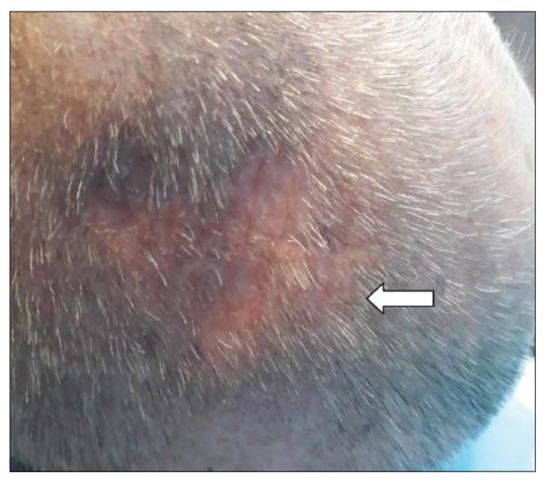
Fig. 4. Post-surgical excision scars after two BCC

Following the corroboration of clinical and paraclinical data, we established the diagnosis of