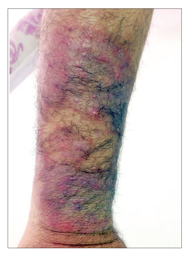
Fig. 1. Majocchi's granuloma left forearm. Multiple follicular pustules, papules and firm, violaceous nodules.